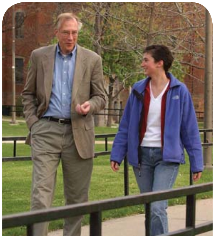
Nobel laureate Thomas Cech walks with a student on the Norlin Quad.

Regardless of the challenges ahead, we will remain committed to those core values. A university degree should, clearly, help advance each graduate's career. But an arts and sciences degree confers so much more. The proper functioning of our government depends on well-educated, rational citizens who know they are "the people" the government is by, for, and of. As unprecedented change buffets the world, the College of Arts and Sciences passes on the skills to discern reliable from dubious information, to differentiate logical and unsound arguments, to understand and recognize broad trends in history, to appreciate the searing imagery of Keats and the delicate virtuosity of Michelangelo. With your generous support today, we are uniquely positioned to accomplish these feats. And more.