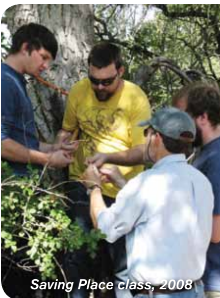
Saving Place class, 2008